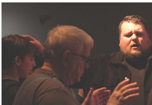
God moving at the altar during Bro Time 2025!

IMPACT GIVING DRIVE is right around the corner! For years, the month of January has been Impact's dedicated month to raise money for the upcoming year's budget. Our goal is $10,000! Please be in prayer with your church about what God is calling you to raise.