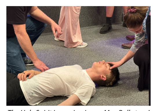
The Holy Spirit is moving in our May Rally tour!

CAMP PRE REGISTRATION is due by June 1st for both High School and Junior High camps. Elementary Camp pre registration is due by July 1st. If you or a helper are planning on working at camp, please fill out a camp worker form as soon as possible!